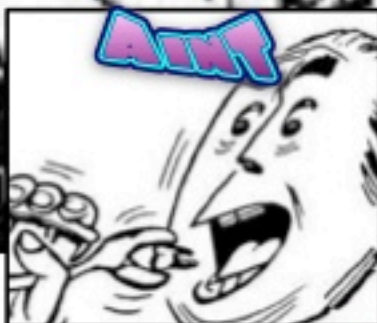
TEN TEETH PULLED HALF THE NOVACAINE